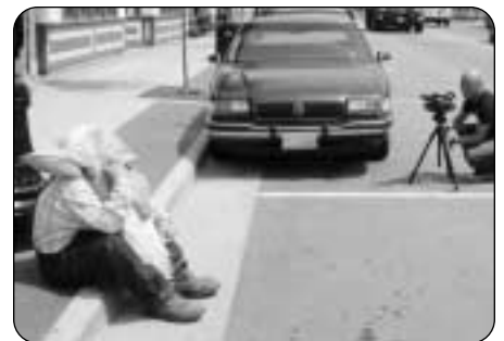
A dejected Ivan the Troll grabs his 15 minutes of fame during the taping of ABC's "My Kind of Town" in Mount Horeb, Wis.

About Mount Horeb – www.trollway.com ; www.uplands.wis , www.MustardMuseum.com . RCP