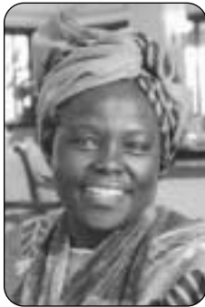
Wangari Maathai, winner of the 2004 Nobel Peace Prize

www.gbmna.org ; www.lanternbooks.com ; www.martin-rowe.com ; www.greenpressinitiative.org .