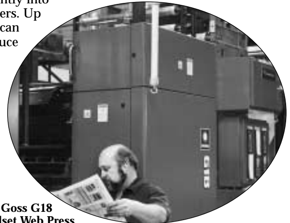
Goss G18 Coldset Web Press

up to 40 pages can be pasted-on-press. Workbook perforation is available.