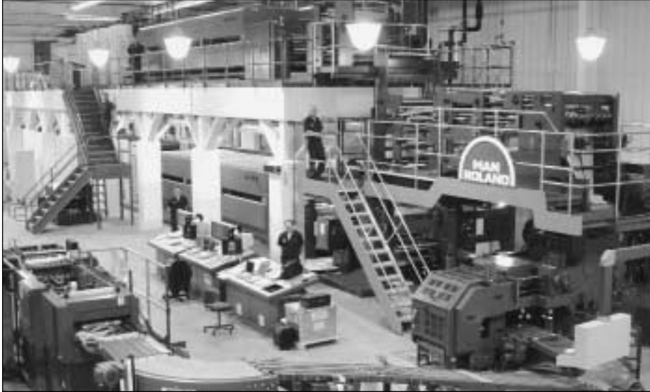
MAN Roland Rotoman N Heatset Web Press

Five coldset and one heatset web presses produce a wide variety of products on an equally wide variety of stocks. From tabloids to book signatures, a variety of page counts, ink color combinations and binding configurations are available.