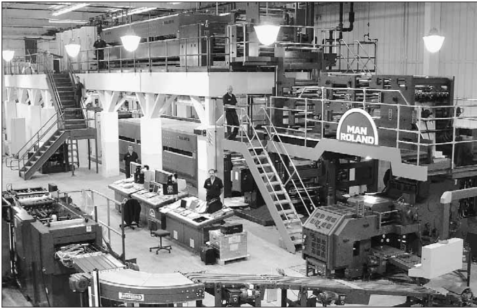
manroland Rotoman N Heatset Web Press

Four coldset and one heatset web presses produce a wide variety of products on an equally wide variety of stocks. From tabloids to book signatures, a variety of page counts, ink color combinations and binding configurations are available.