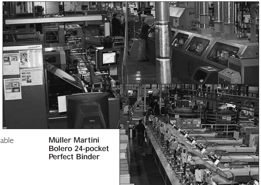
Müller Martini Bolero 24-pocket Perfect Binder