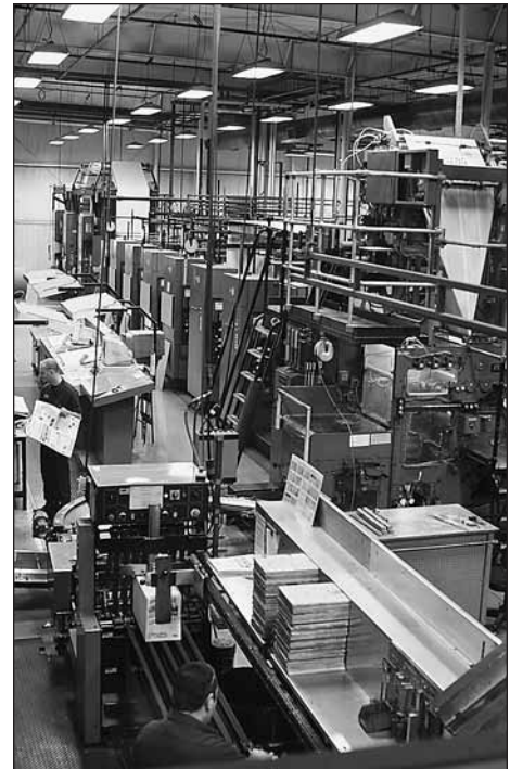
Goss G18 Coldset Web Press

■ The Goss Community press line consists of five mono units, two 4-high units and one folder. Up to six webs can be run to produce tabloid or broadsheet projects.